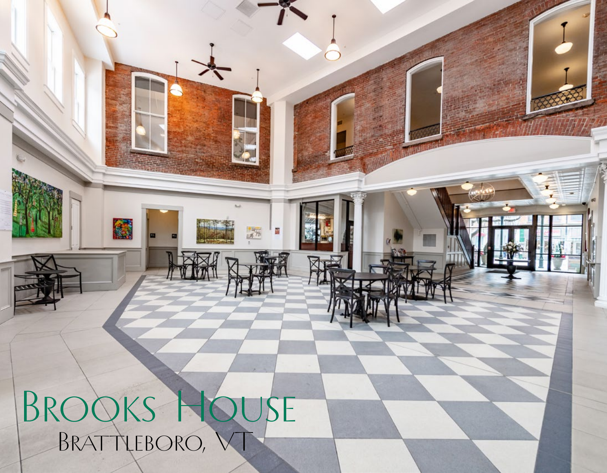
BROOKS HOUSE BRATTLEBORO, VT